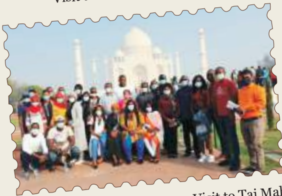
Visit to Taj Mahal and Fatehpur Sikri