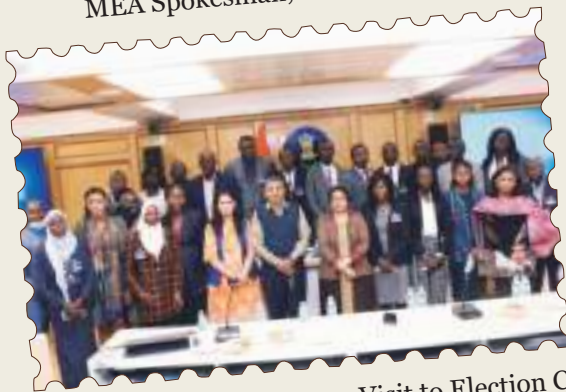
Visit to Election Commission of India (ECI)