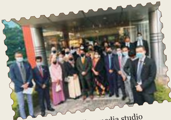
Visit to Indian media studio