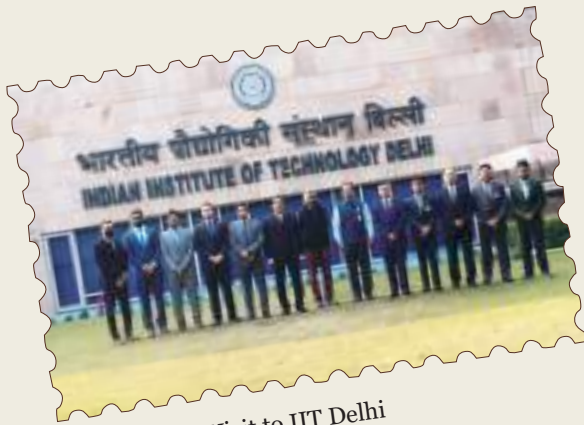
Visit to IIT Delhi