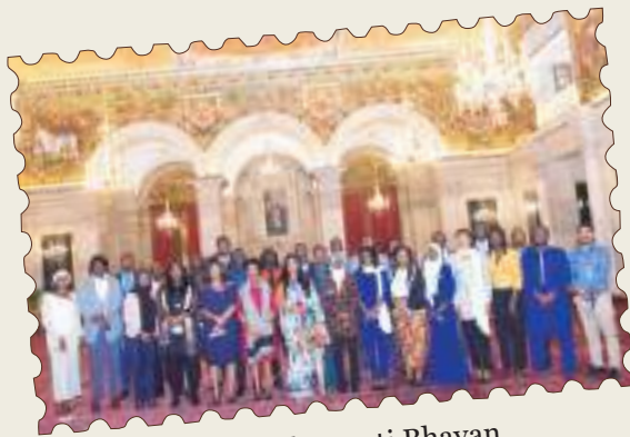
Visit to Rashtrapati Bhavan