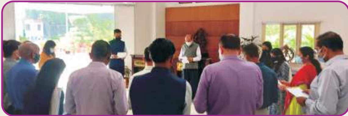
Dean (SSIFS) administered the Rashtriya Ekta Diwas pledge on 31 October 2021