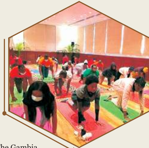
Diplomats from The Gambia participated in the Yoga Session