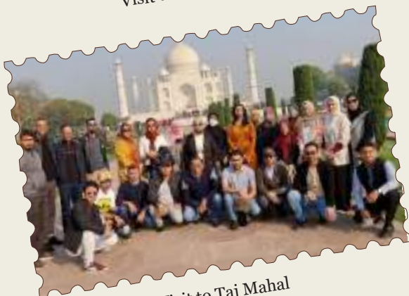
Visit to Taj Mahal