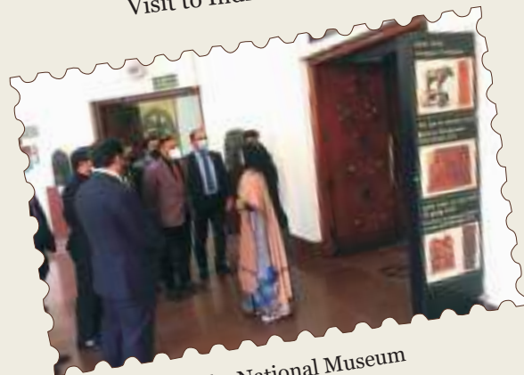
Visit to the National Museum