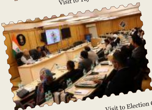
Visit to Election Commission of India