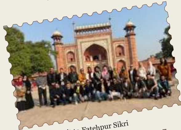
Visit to Fatehpur Sikri