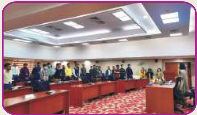
Joint Secretary (SSIFS) administered the Constitution Day pledge on 26 November 2021 to Personal Assistants and Stenographers during their Induction Training Programme