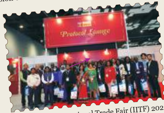
Visit to India International Trade Fair (IITF) 2021