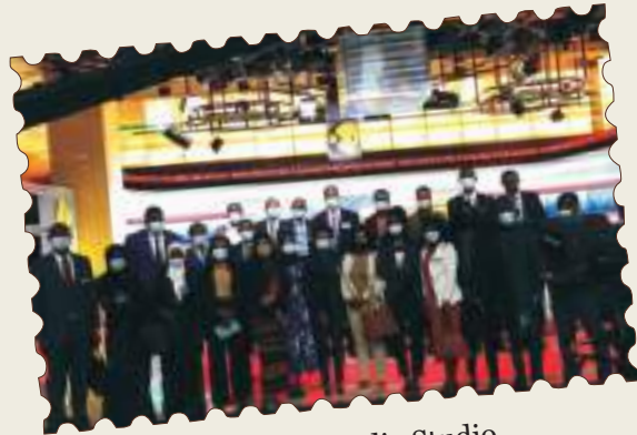
Visit to Media Studio