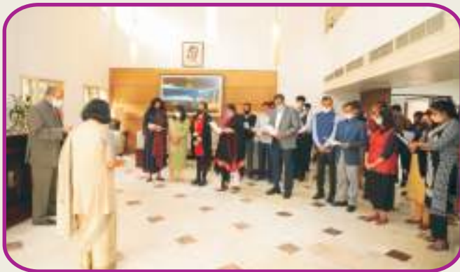
Dean (SSIFS) administered the Constitution Day pledge on 26 November 2021